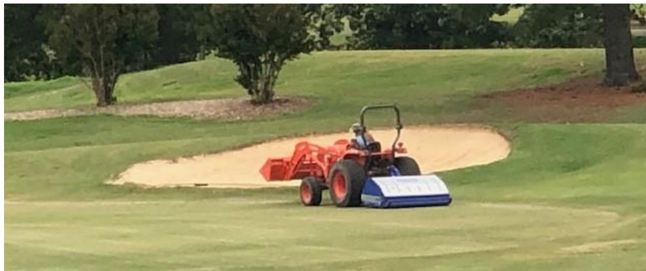
Wes using ShockWave machine on #16 green.

For more information on putting green management, visit the Course Care section of USGA.org or contact your regional USGA agronomist.