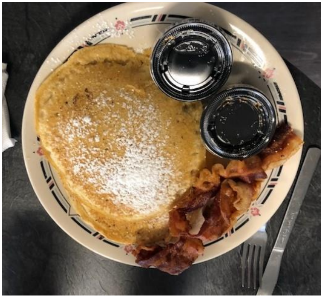
Pancakes and bacon

Enjoy these breakfast items every day, all day.